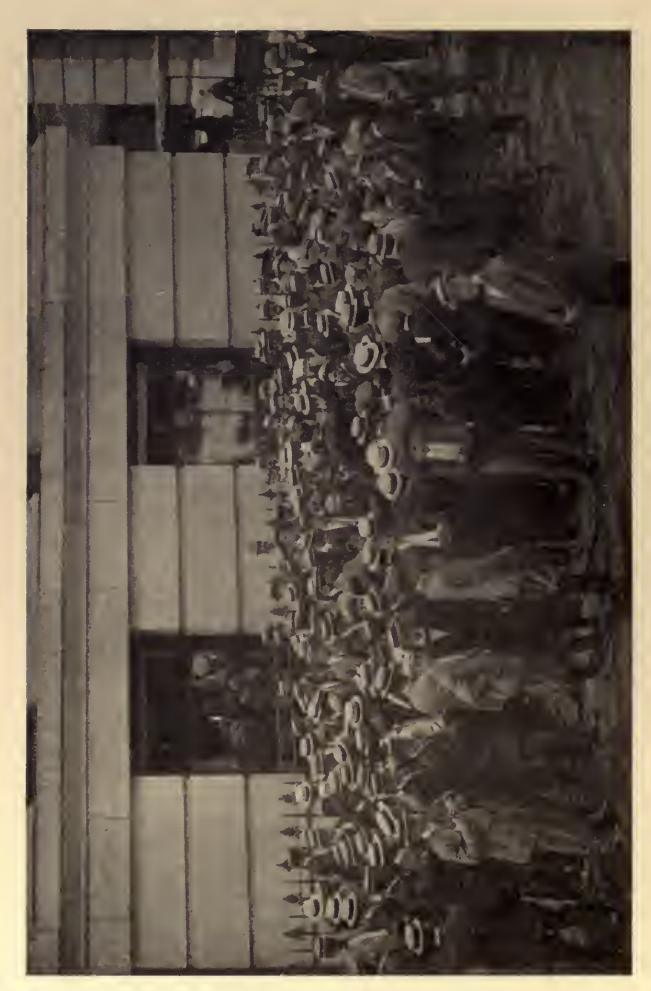
" The Voice of the City."